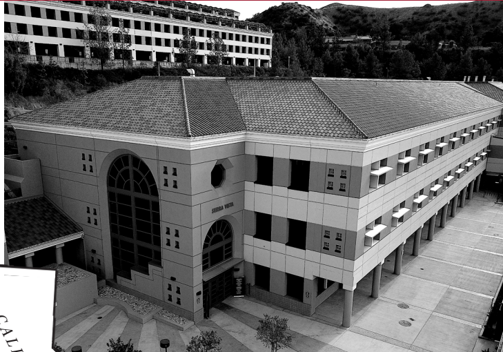
Sierra Vista Bldg. (pictured) location of International Student Office (on third floor)

International Student Link: www.glendale.edu/international