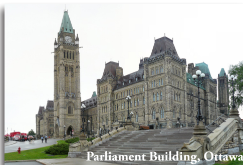
Parliament Building, Ottawa

as a nation's capital city should. We'll visit Parliament Hill to see the Changing of the Guards and enjoy a guided tour of Canada's Parliament building . We'll see the Supreme Court , the Canadian Mint , the Prime Minister residence as well as the War Memorial , the Peace Tower and Rideau Canal . Enjoy time at leisure in Byward Market , known for its fruits, vegetables, flowers and arts & crafts. Perhaps you'll try the local specialty – a beavertail – a delicious Canadian delicacy consisting of a fried pastry with a variety of tasty toppings. This afternoon we'll visit the world-renowned Canadian Museum of Civilization , showcasing Canada's cultural heritage from the ancient past to the present day. Exhibits cover the period of early Norse settlement, exploration, and fur-trading days, as well as the achievements of the latest generations. The evening is free for you to spend as you choose in this splendid city. Our deluxe hotel is conveniently located in downtown Ottawa. (Breakfast)