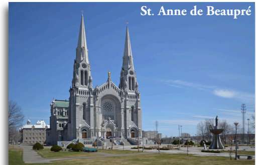
St. Anne de Beaupré

monuments and churches clustered along cobble-stoned streets seem right out of 18 th century Europe. On our comprehensive tour we'll see Parliament , Place d'Armes , and enjoy a leisurely walking tour of ancient Place Royale , the site of the original settlement of the city of Québec. A visit to the Plains of Abraham , site of a 20-minute battle that changed the continent's destiny. We'll enjoy an included exquisite lunch at the stately Le Château Frontenac , one of Canada's iconic hotels and perhaps the most photographed hotel in the world. Enjoy time at leisure for your own exploration in Old Québec to take in the historic sites, take a carriage ride, or do some shopping at the boutiques and galleries. (Breakfast, Lunch)