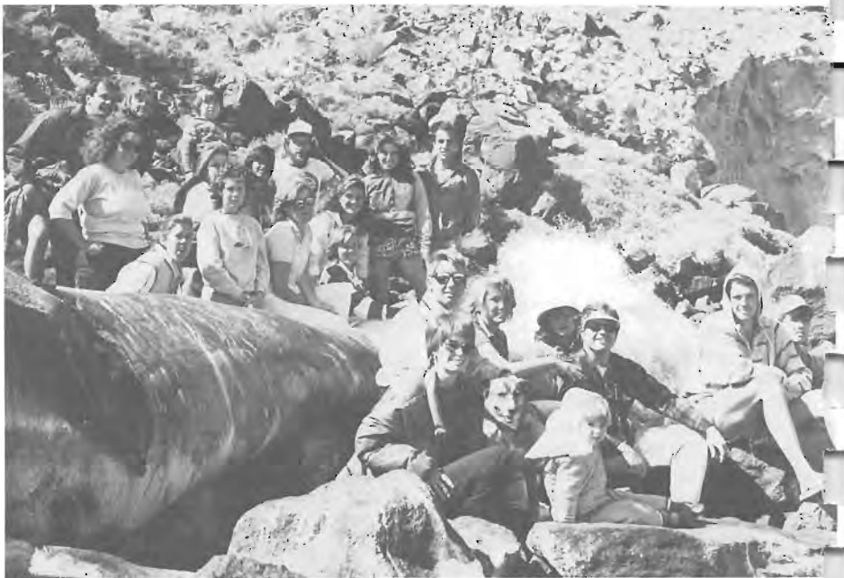
Students from the Baja Field Studies Program pose next to a specimen of a California grey whale found floating at Bahia de los Angeles. The skeleton will eventually be articulated and donated to the Bahia Museum where it will serve as a teaching tool for visitors and student alike.