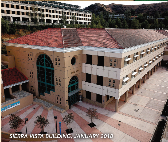
SIERRA VISTA BUILDING, JANUARY 2018