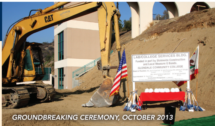
GROUNDBREAKING CEREMONY, OCTOBER 2013

The third floor strategically places all Student Services in a one-stop centralized location making it easier for students to achieve their educational goals as members of GCC's premier learning community.