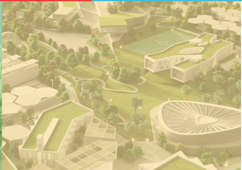
sustainable environmental design