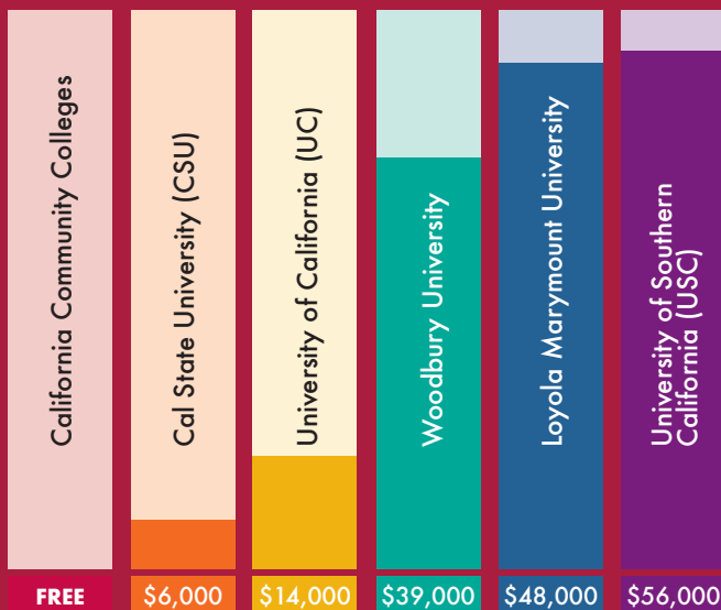
ESTIMATED ANNUAL TUITION (BASED ON FULL-TIME ATTENDANCE)

In addition to being adaptable and reliable, GCC is affordable . Our already low-cost tuition is dollar-for-dollar the best investment you can make. GCC offers a variety of ways to pay for your education, including the GCC Promise. As a first-time, full-time student, you may be able to attend GCC up to two years tuition-free with the GCC Promise!