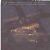
Photograph of the building's exterior courtyard area.