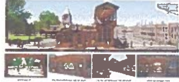
Photograph of the building's exterior courtyard area.