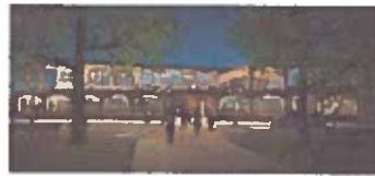
Photograph of the building's exterior courtyard area.

Project description: The Sanctuary building is a new addition to the Glendale Community College campus. It is a two-story building that will house the college's new library and student center. The building is designed to be a modern, open-plan structure that will provide a welcoming environment for students and faculty alike. The design features a mix of materials, including brick, concrete, and wood, and a series of large, open-air courtyards that will provide a sense of connection to the surrounding campus. The building is also designed to be sustainable, with features such as solar panels and energy-efficient lighting.