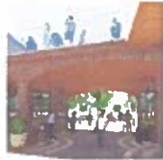
Photograph of the building's exterior facade.