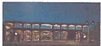
Photograph of the building's exterior courtyard area.