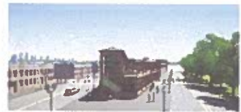
Photograph of the building's exterior courtyard area.