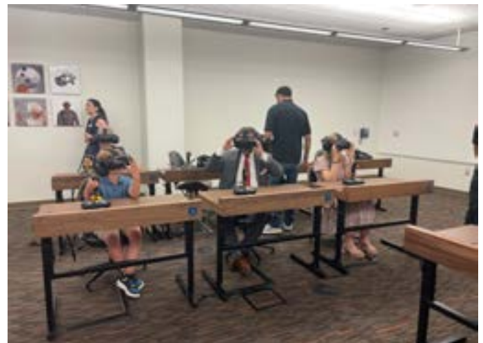
Guests participate in virtual reality lesson during the Foundation's President's Circle event