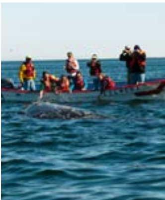
Students explore the Sea of Cortez during a class at the Baja Field Station

Students in the program can meet biology requirements while taking a variety of other classes and exploring a unique environment, leading to close relationships and improved academic performance. This program is made possible in part by our generous donors and dedicated faculty and staff. Just one of many ways we continue to impact students' lives.