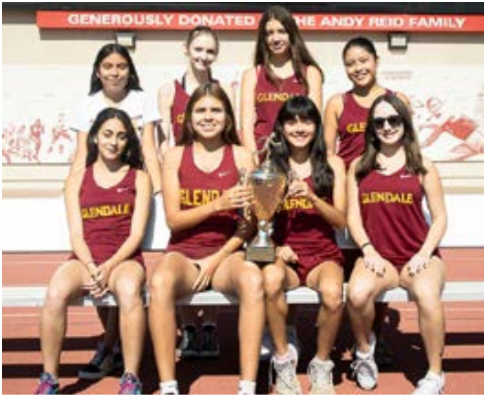
GCC's Women's Cross Country Team celebrates its 18th consecutive Western State Conference championship