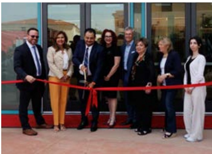
The GCC board of trustees and current and former presidents cut the ribbon on the Buena Vista science building