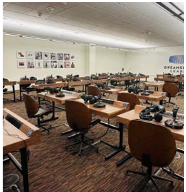
The new fully-equipped virtual reality lab, in partnership with Dreamscape Learn