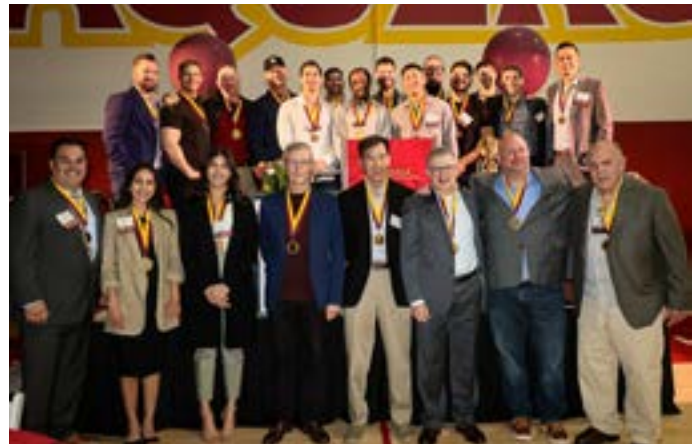
The 17th Athletic Hall of Fame Honorees

Learn about more ways to support GCC athletics at glendale.edu/hof